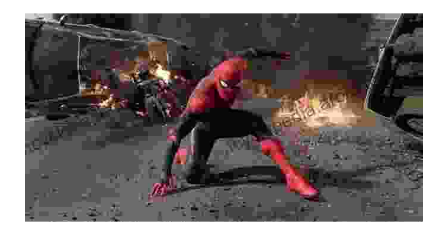
Still from Spider-Man Far From Home featuring Peter Parker and Mysterio