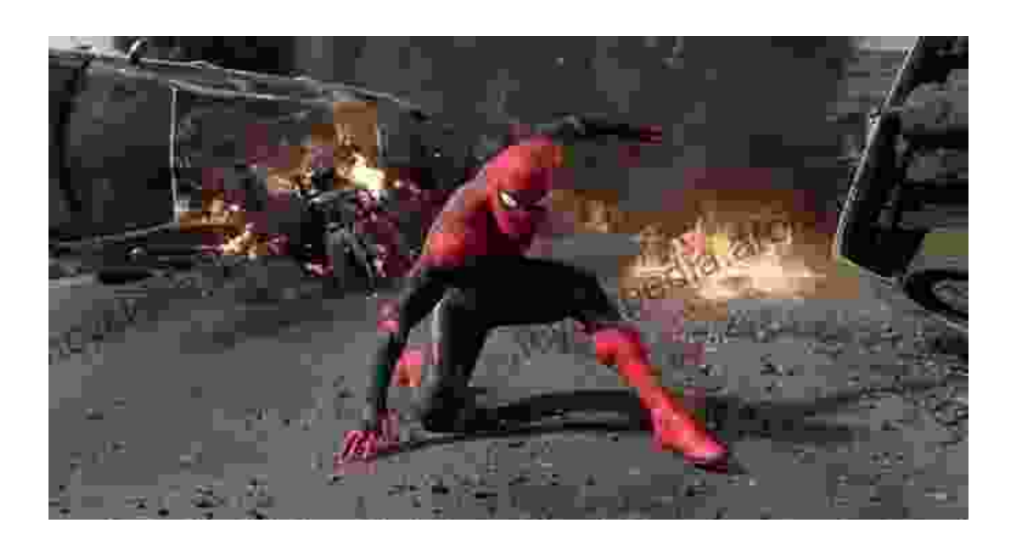
Spider-Man: Far From Home Picture Book (Spider-Man Far from Home) by Calliope Glass