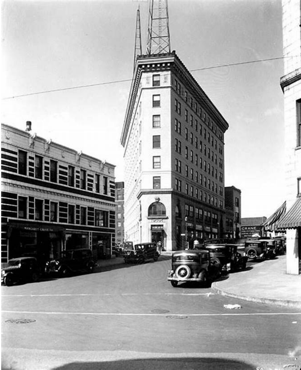
Figure 4: The Flat Iron Building, a symbol of Asheville's architectural diversity and urban vitality.