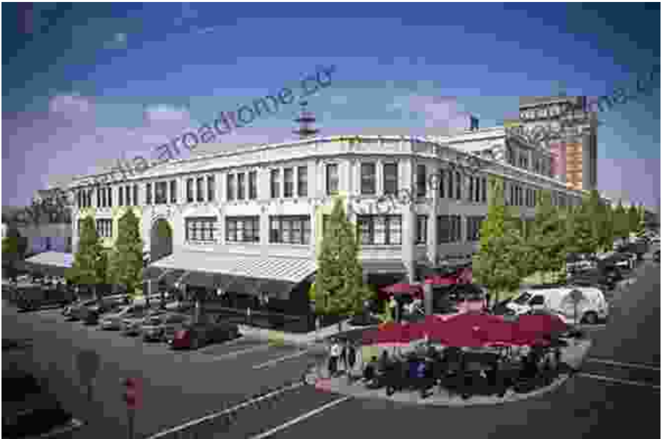
Figure 2: Grove Arcade, a vibrant hub of commerce and culture that has played a pivotal role in Asheville's development.

and tourists alike, preserving the city's architectural heritage while embracing the present-day community.